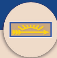
ARROW OF LIGHT Fifth Grade